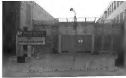
Park Slope elementary school, Park Slope NY